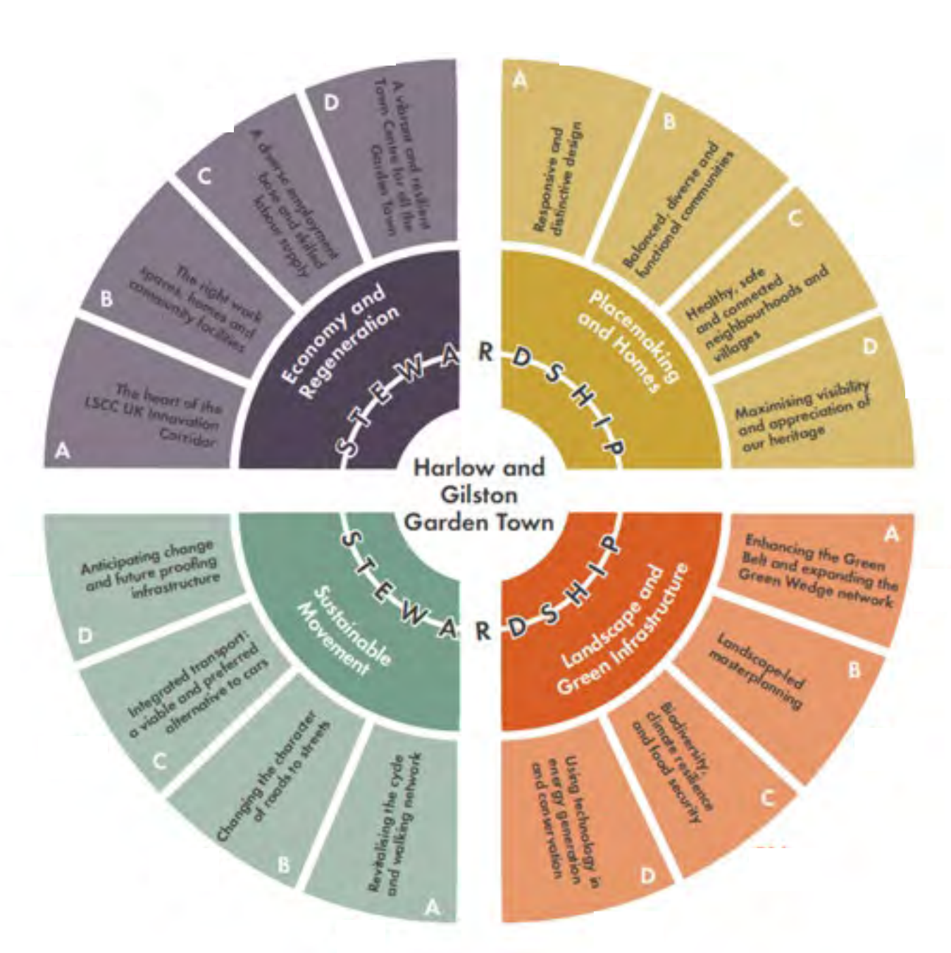
Fig 1. Relationship between the Key Principles for Healthy Growth, as set out in the HGGT Vision, November 2018.